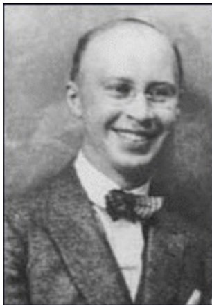
By Sergei Prokofiev