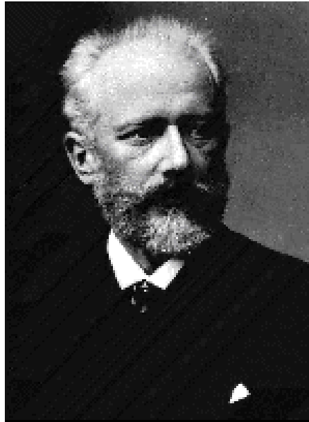
Peter Ilyich Tchaikovsky (1840-1893)